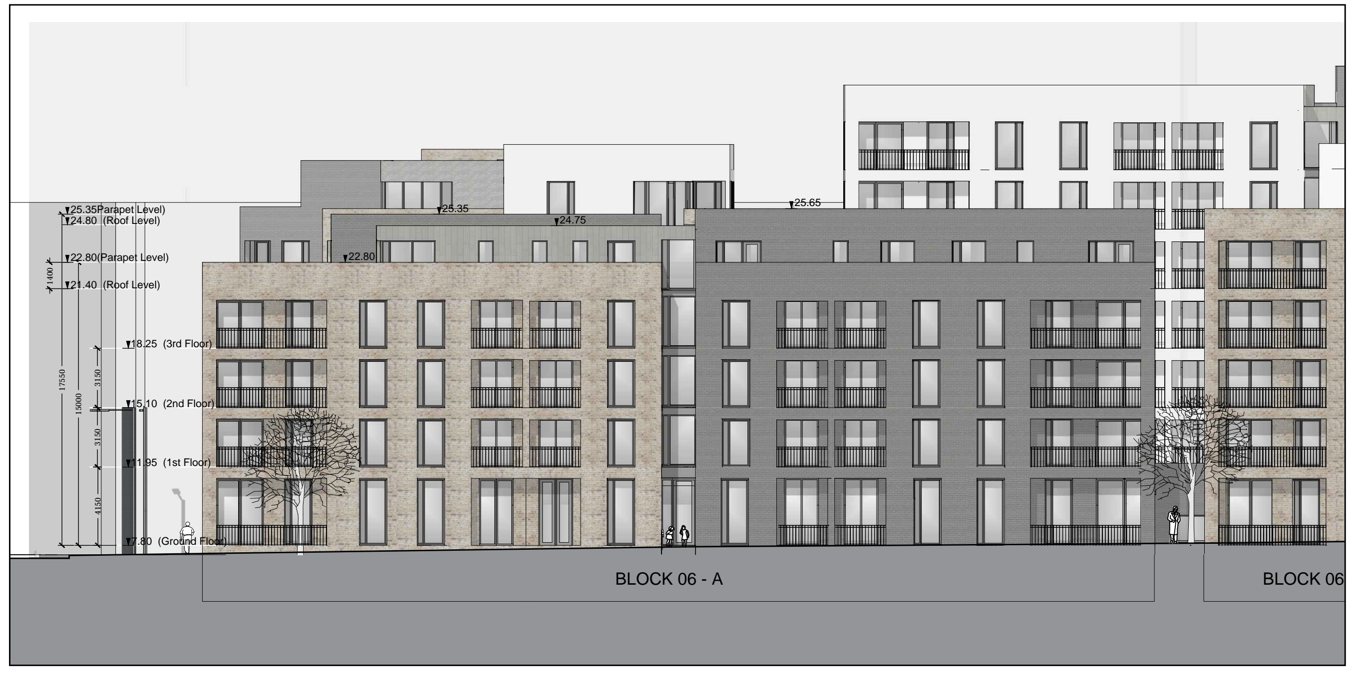
B06 - A - WEST ELEVATION Scale 1:200