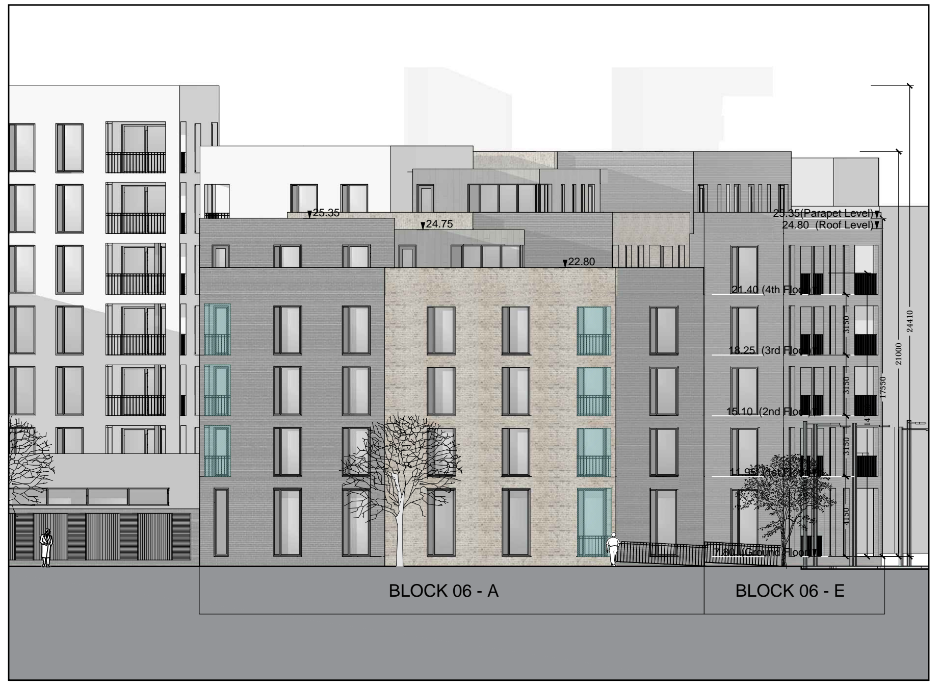
B06 - A - NORTH ELEVATION Scale 1:200