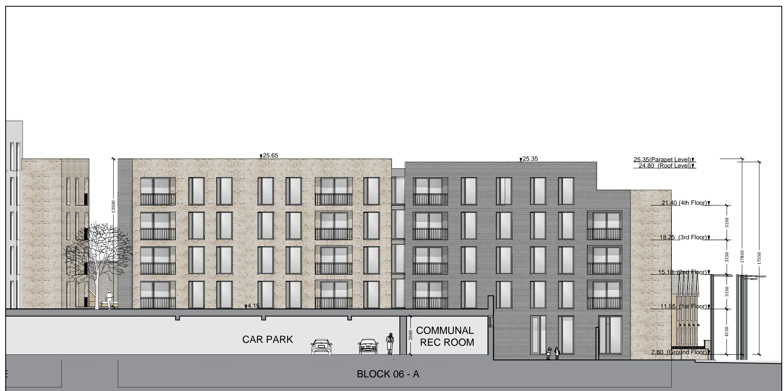
B06 - A - EAST ELEVATION Scale 1:200