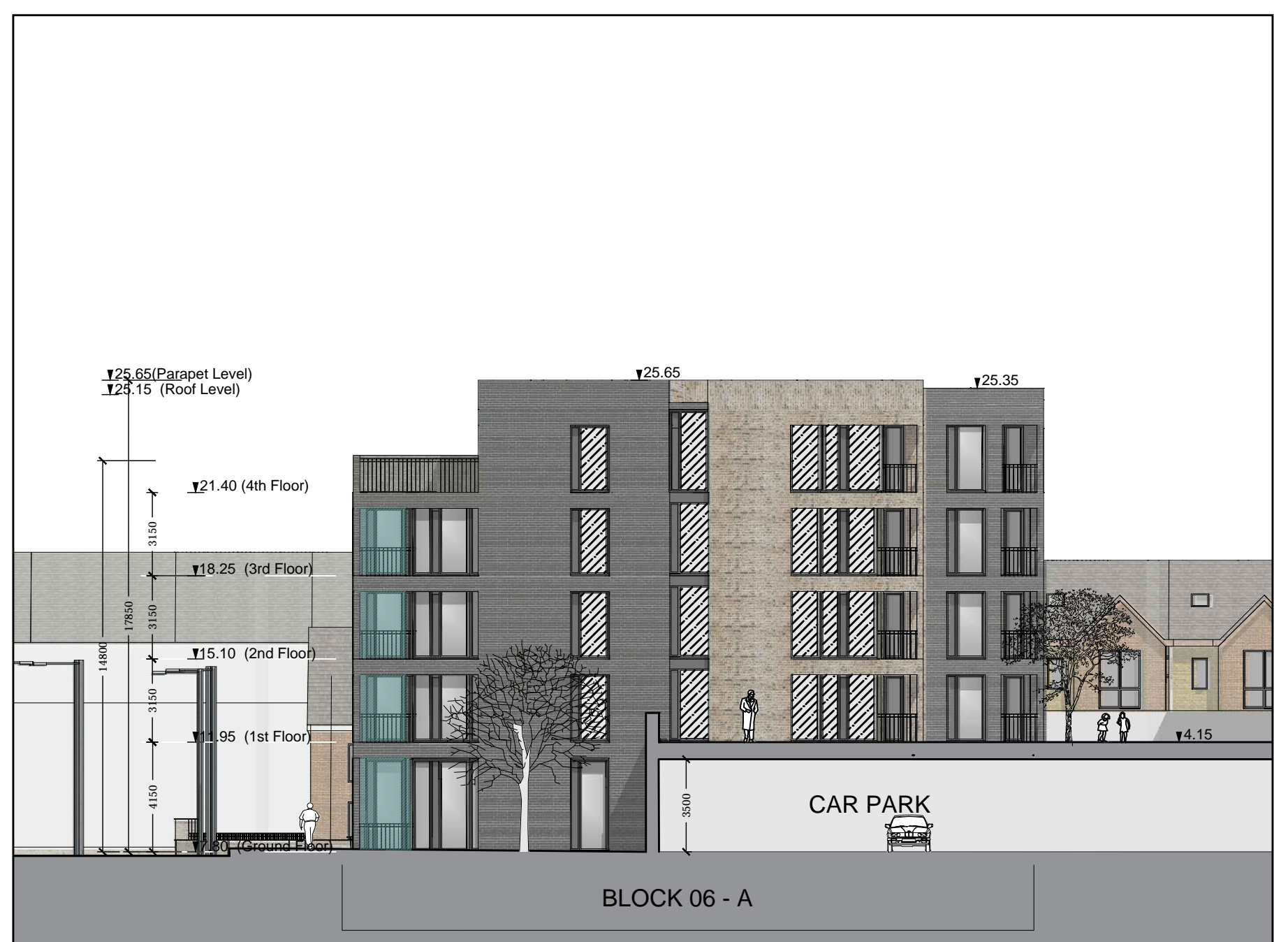
B06 - A - SOUTH ELEVATION Scale 1:200